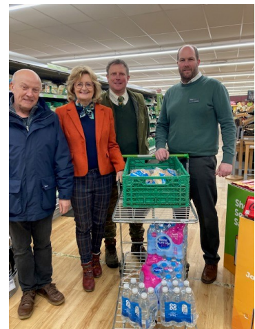
Manager at Co-op donating refreshments for volunteers taking part in The Great British Spring Clean